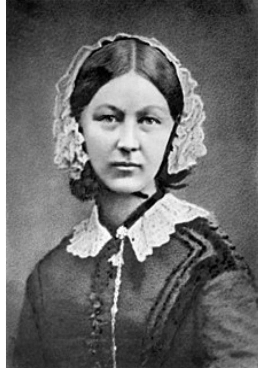
Florence Nightingale, c. 1860