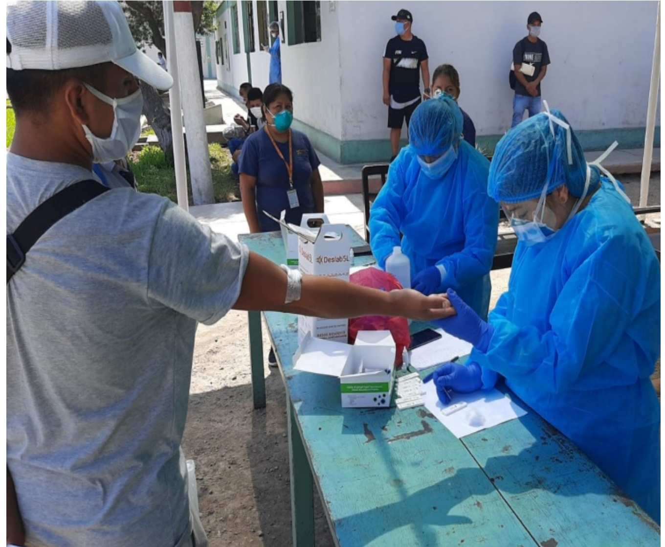
Clinicians working with Socios En Salud, as PIH is known in Peru, perform COVID-19 rapid tests in a neighborhood of Lima, Peru.