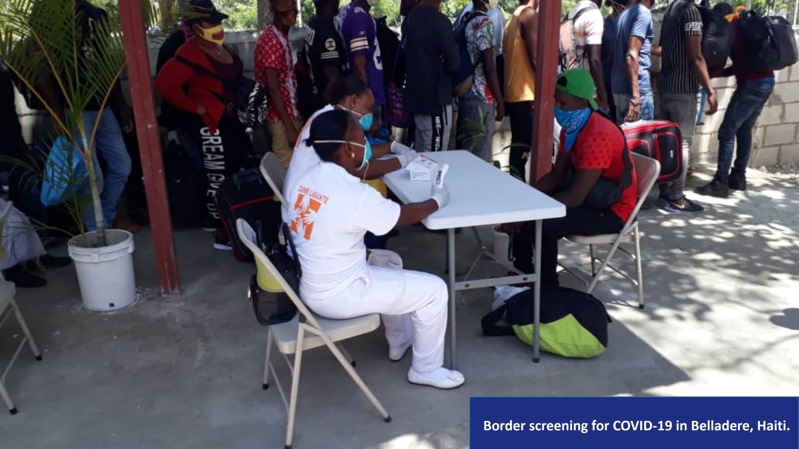
Border screening for COVID-19 in Belladere, Haiti.