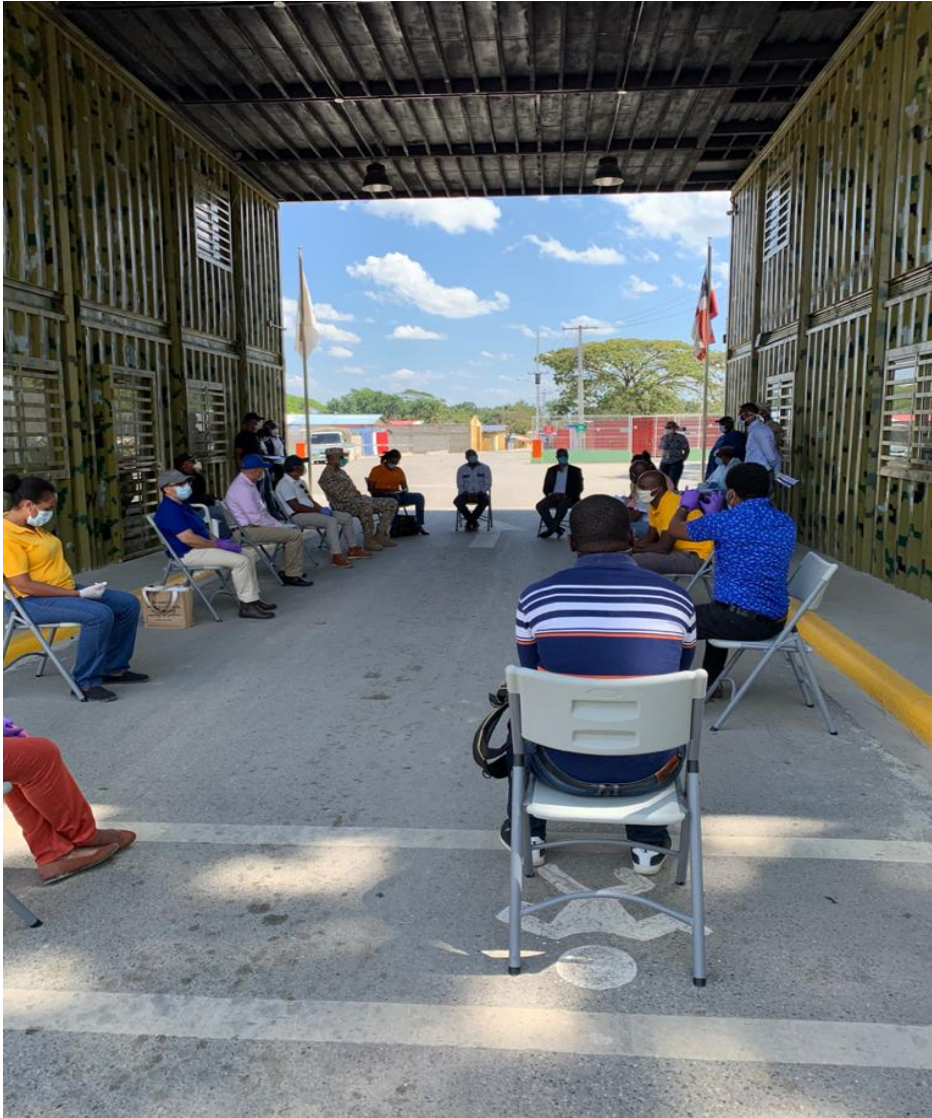
Zanmi Lasante staff meet at the border with government officials from the Dominican Republic to discuss COVID-19 preparedness.