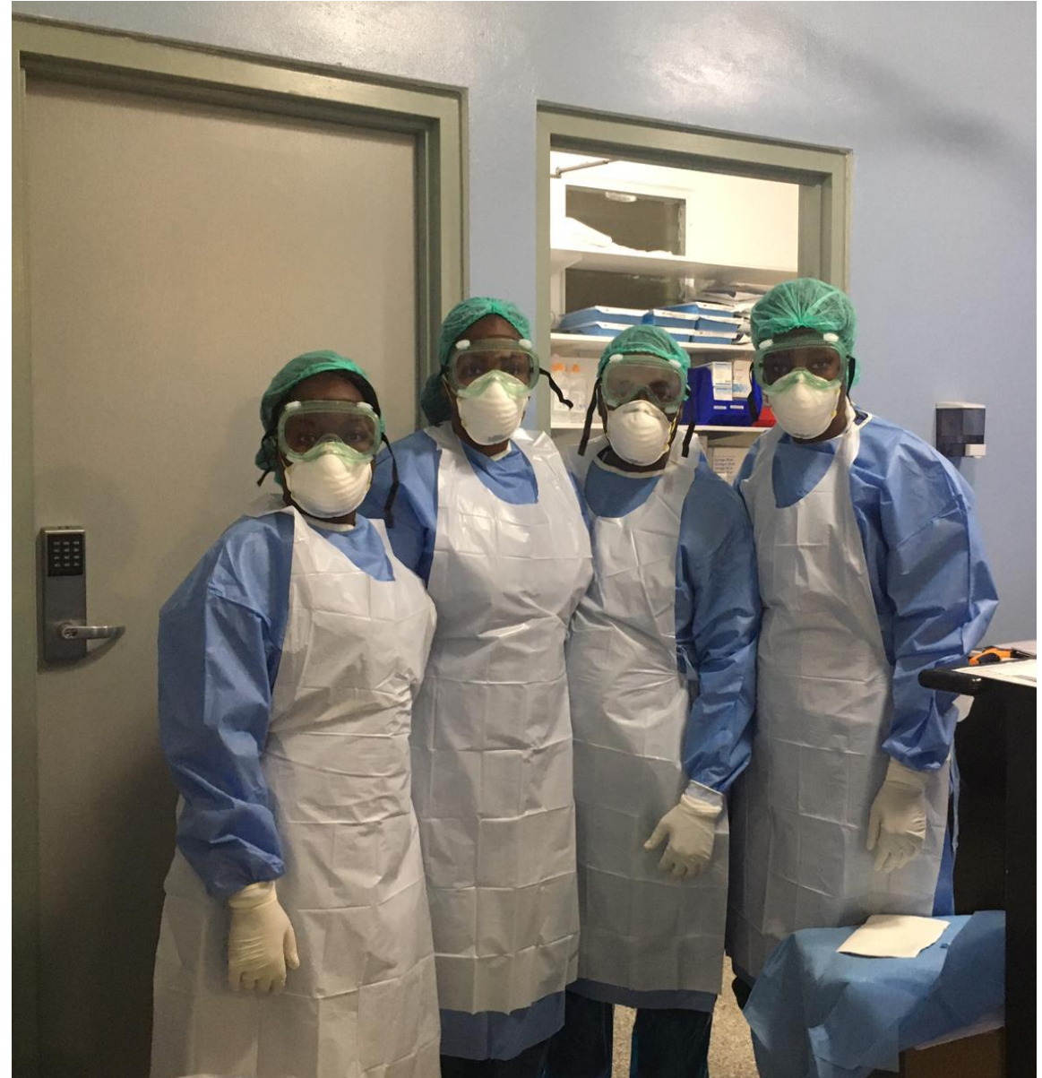
Clinicians in the COVID-19 ward, Haiti.