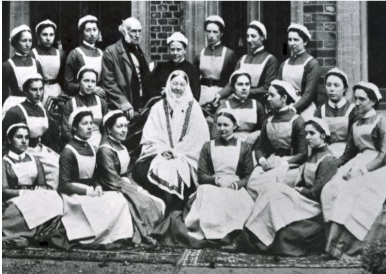
Florence Nightingale (middle) in 1886 with her graduating nurses class