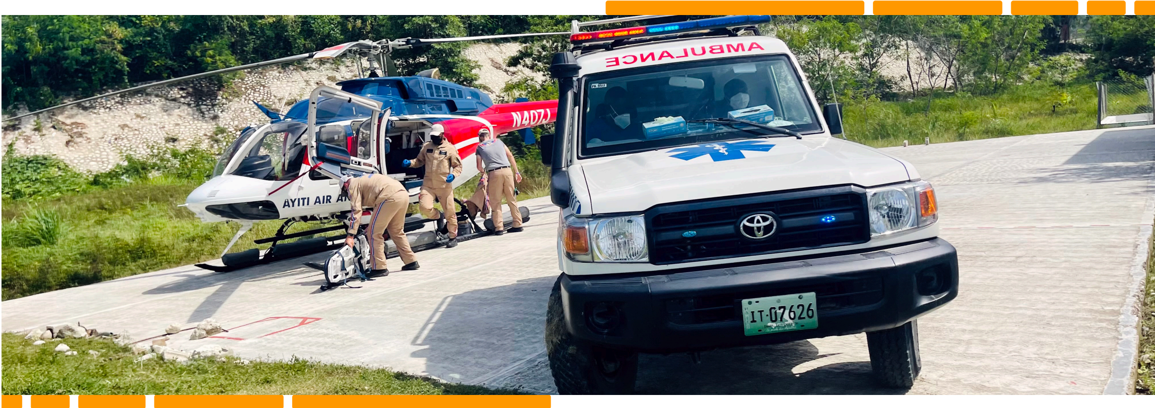
Victims of the August 14 earthquake arrive at Hospital Universitaire de Mirebalais via helicopter air ambulance.