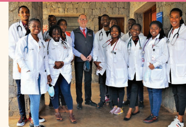
Paul Farmer with medical students at Butaro District Hospital in January 2022.

and across Africa, catalyzing the development of sustainable, equitable health systems that improve health care delivery to underserved populations. The work of the collaborative will involve the exchange of students, postdoctoral trainees, and faculty between UGHE and HMS; support for research, education, and teaching; an annual global health conference; and clinical training opportunities for medical students and residents.