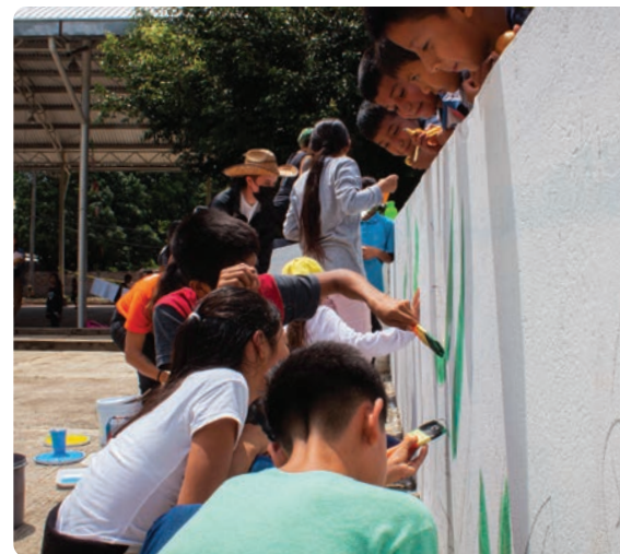
Above: Students begin painting their mural in Reforma, Chiapas.