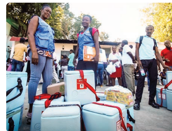
← LEFT: Coolers filled with oral cholera vaccine are prepared for distribution across various communities within Mirebalais.