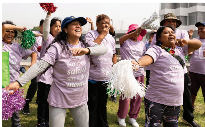
PERU | Patients and their families participate in mental health programming.