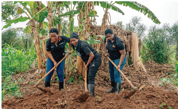
RWANDA | PIH staff work on building a garden for a patient with HIV.

In 2024, we triumphed over adversity, provided lifesaving care, and experienced shared moments of joy along the way. Get a glimpse of some of the moments PIH donors and partners made possible this year: